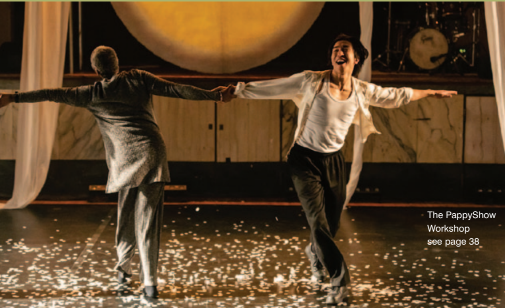
The PappyShow Workshop see page 38

LIMF'23 brings the chance to study different physical and visual theatre skills with leading practitioners, including various forms of clown, puppetry, mime and devised theatre.